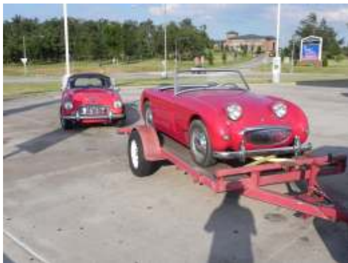
Bugeye on trailer borrowed from Don Ethridge. My parent's 3000.