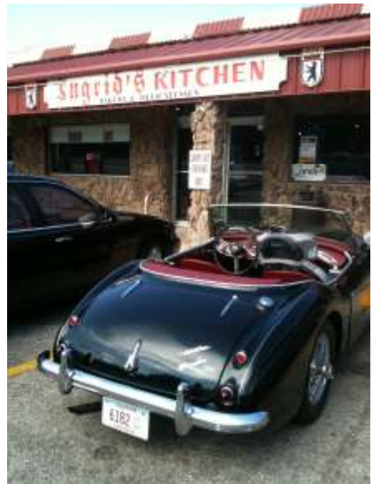
Nathan's New 100-6